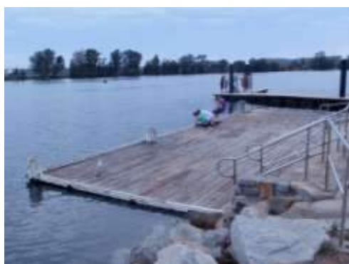
Wharves at Moruya (left) and Mossy Pt (right) during a king tide. This gives an idea of the predicted average tides in 50 years time.