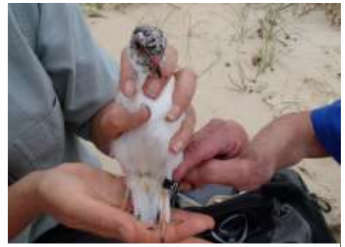
Juvenile Hooded Plover