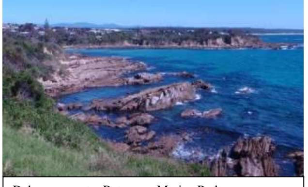
Dalmeny coast - Batemans Marine Park