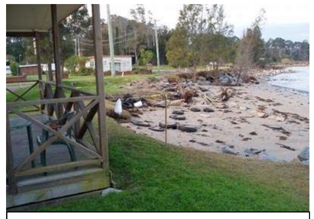
Erosion at Wharf Rd, Batemans Bay 2005

CZMPs are based on the goals and objectives of the NSW Coastal Policy (NSW Government 1979) and the NSW Sea Level Rise Policy Statement (NSW Government 2009) and assist in implementing integrated coastal zone management. The Coastal Protection Act 1979 and Guidelines for preparing Coastal Zone Management Plans (DECCW 2010) detail the minimum requirements for preparing coastal zone management plans.