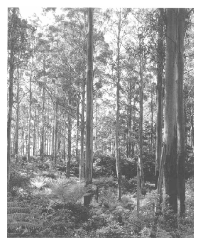
Preferred shape for sawlog trees