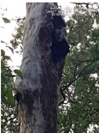
Hollow Bearing Tree 2 next to Cpt 58/2 road currently being logged.

A shape file may be able to be provided with the photos for each pin for each tree this week using Avenza Pro.