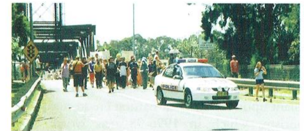
2,500 people march over Batemans Baybridge protesting against the Charcoal Factory

Members of the local community and businesses have come together as Charcoalition – Communities for a Charcoal-Free South Coast, and have gained wide support for their campaign to oppose the building of the Charcoal Factory. Local progress associations, numerous businesses, local organisations including Eurobodalla Tourism and Batemans Bay Chamber of Commerce have publicly expressed their opposition to this proposal. Others to reject this proposal include Eurobodalla Shire Council and Aboriginal Land Councils. Over 2000 people have attended public meetings about the charcoal proposal with the vast majority showing support for a Charcoal-Free South Coast.